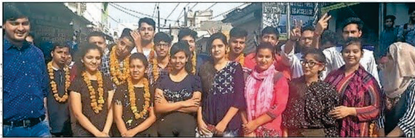
हयात एजुकेशनल सर्विसेज के टॉपर छात्र-छात्राओं को शुक्रवार को सम्मानित किया गया।