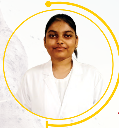
ANUGREH MESH MBBS Medical College (Srinagar)